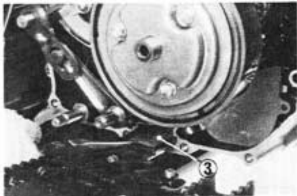
(5) Oil filter screen