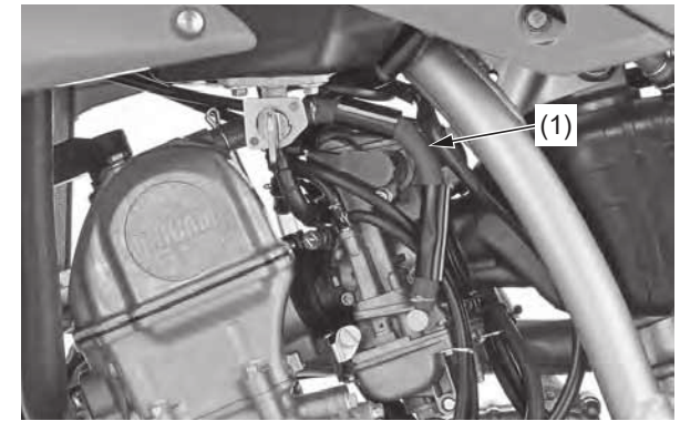
(1) fuel line