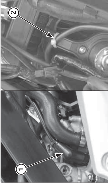
(1) SPARK PLUG CAP (2) TIE-WRAP

Replace the ignition coil if the resistance is out of specification.